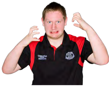
Very sad or upset

These feelings are normal and may include feeling: