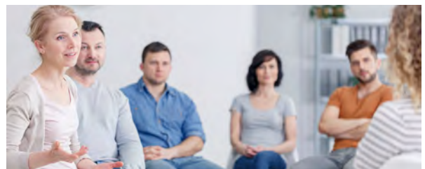
In a group